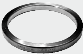
BX Type Ring