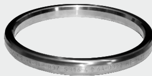
R Type Ring