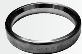
RX Type Ring