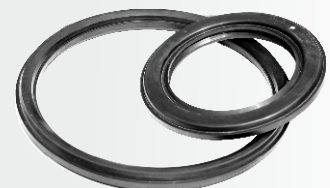
Buna Coated Ring