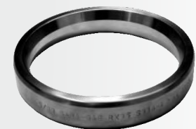
RX Type Ring