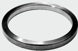
BX Type Ring