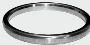
R Type Ring