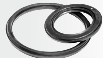
Buna Coated Ring